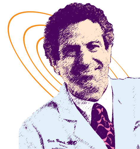
Sponsored by UMPC Hamot