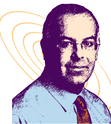
Sponsored by Erie Insurance