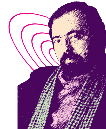
Sponsored by Custom Engineering