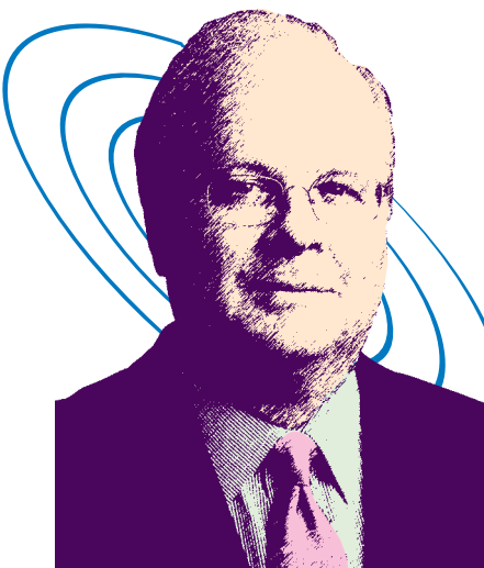
Sponsored by LECOM