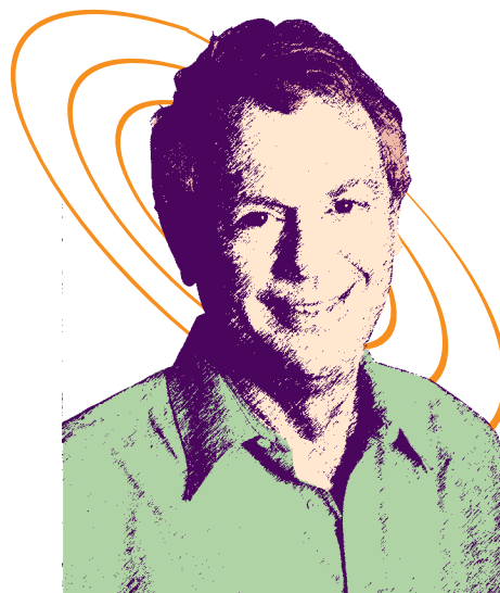
Sponsored by Better Baked Foods